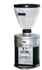
Expobar 30 Grind on Demand (available as double)