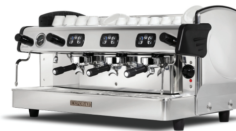
Control 3 GR