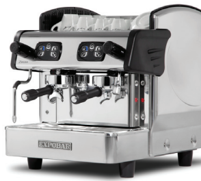
Mini Control 2 GR