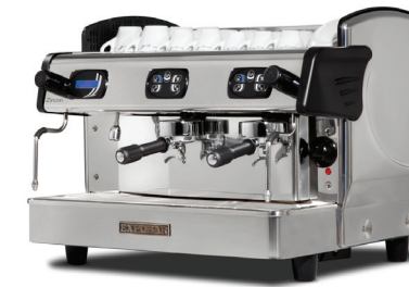
Display Control 2 GR