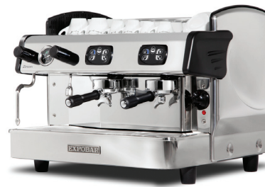
Control 2 GR