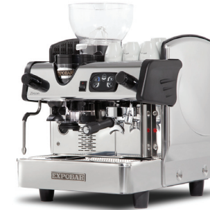
Mini Control 1 GR with grinder