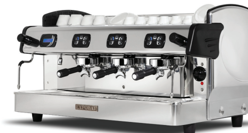
Display Control 3 GR