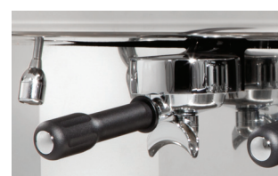
Components of the highest quality