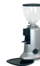
Expobar 600 Grind on Demand