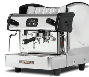
Mini Control 1 GR