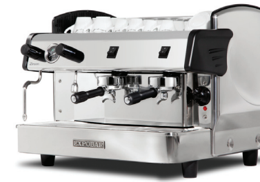
PULSER 2 GR